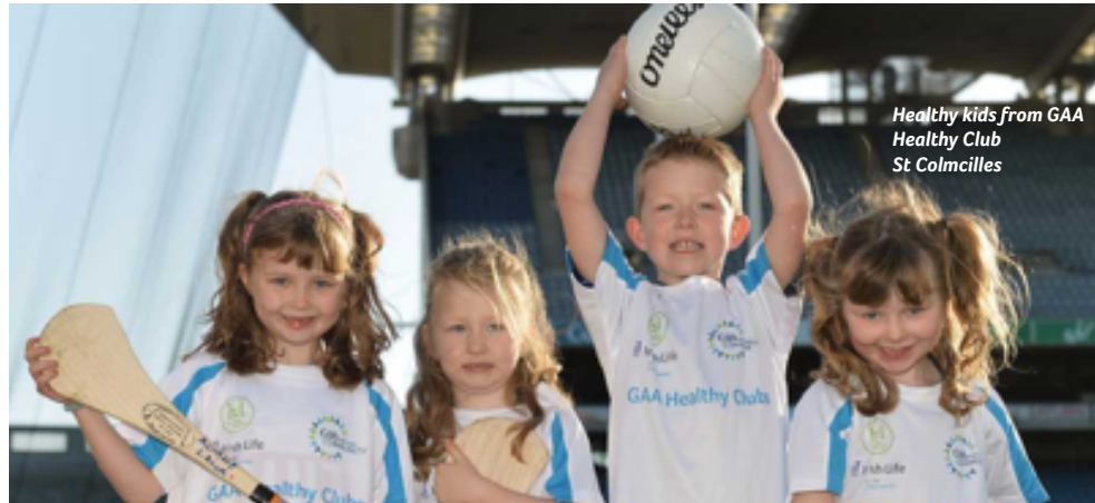
Healthy kids from GAA Healthy Club St Colmcilles