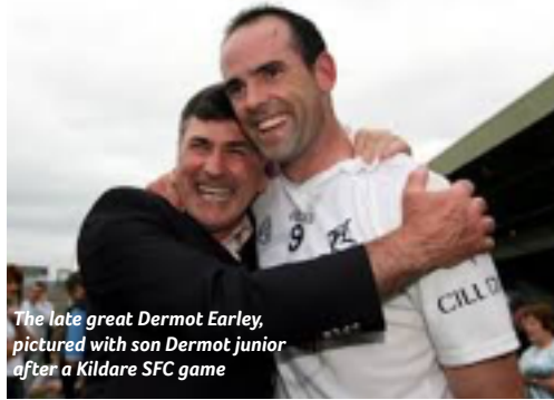
The late great Dermot Earley, pictured with son Dermot junior after a Kildare SFC game

‘Your attitude is more important than your ability, your motives are more important than your methods, your courage is more important than your cleverness and always have your heart in the right place’ - Dermot Earley Snr.