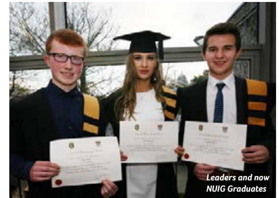
Leaders and now NUIG Graduates

On October 14th a number of participants who completed the programme in June received their Foundation Certificate in Youth Leadership and Community Action in NUIG. A memorable day by all involved.