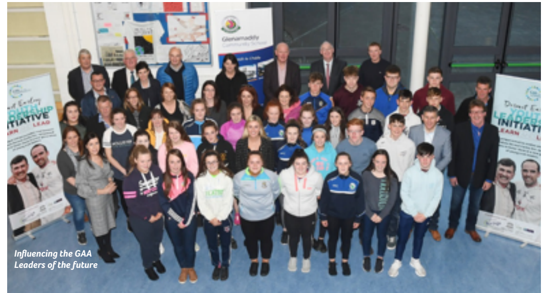
Influencing the GAA Leaders of the future

Those who complete all 3 modules will have the opportunity to graduate from NUIG with a Foundation Certificate in Youth Leadership