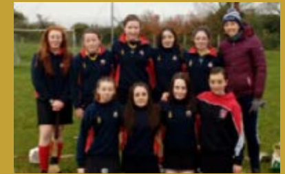
Scoil Ui Mhuiri