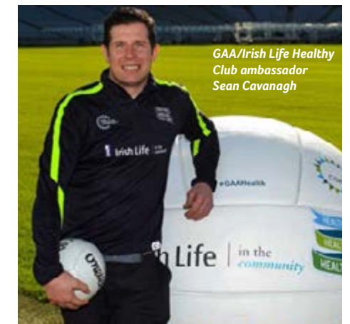
GAA/Irish Life Healthy Club ambassador Sean Cavanagh

Office for Suicide Prevention, the Public Health Agency, and Irish Life, for helping to make the Healthy Club project the success it is. We look forward to growing it from strength to strength."